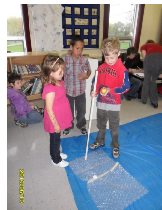
I wonder how many bubbles will break when I drop this apple?